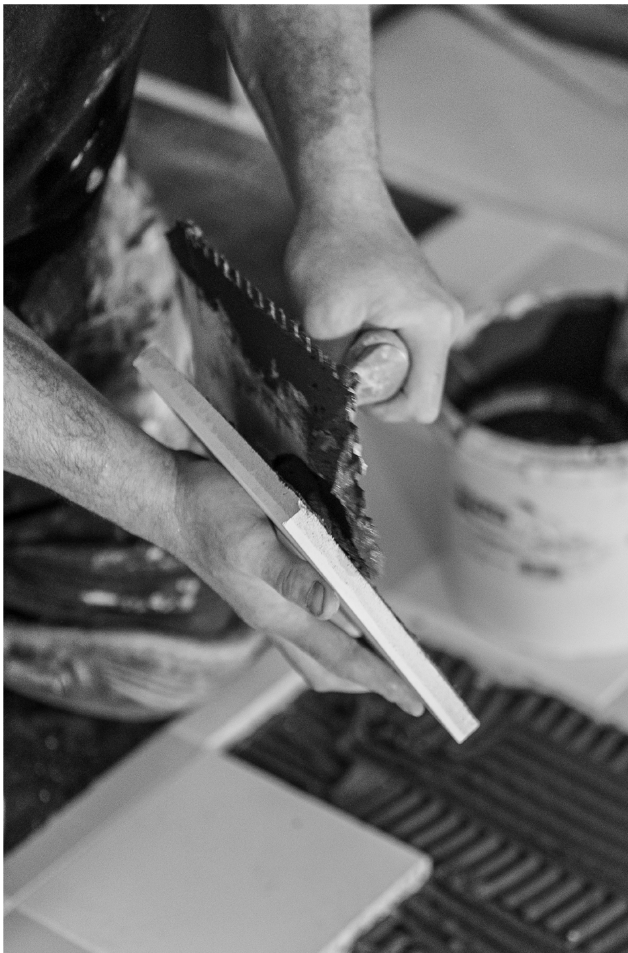
Mosaic Factory Floor tiles