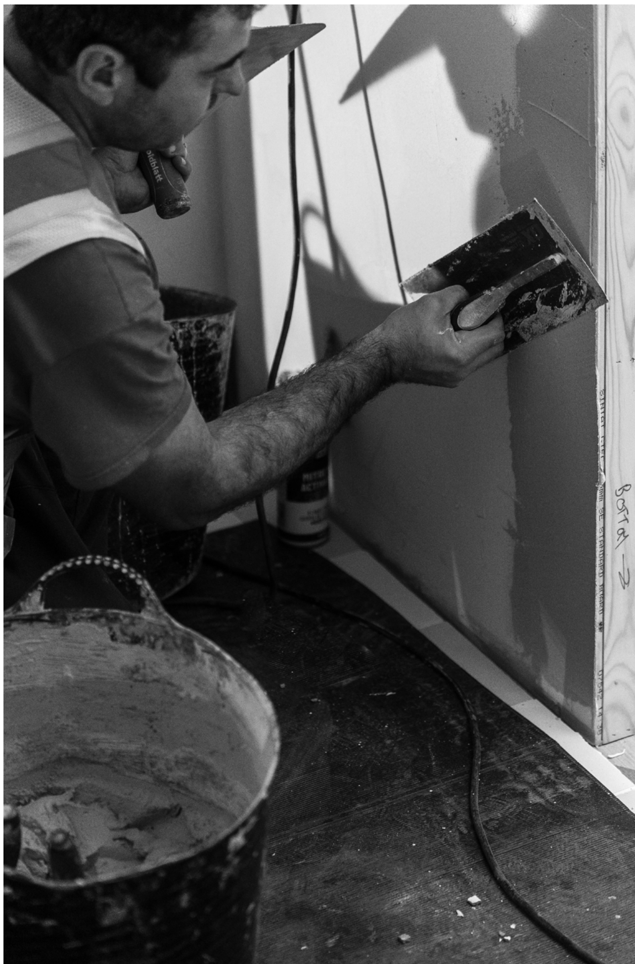
Clayworks Natural Wall Covering